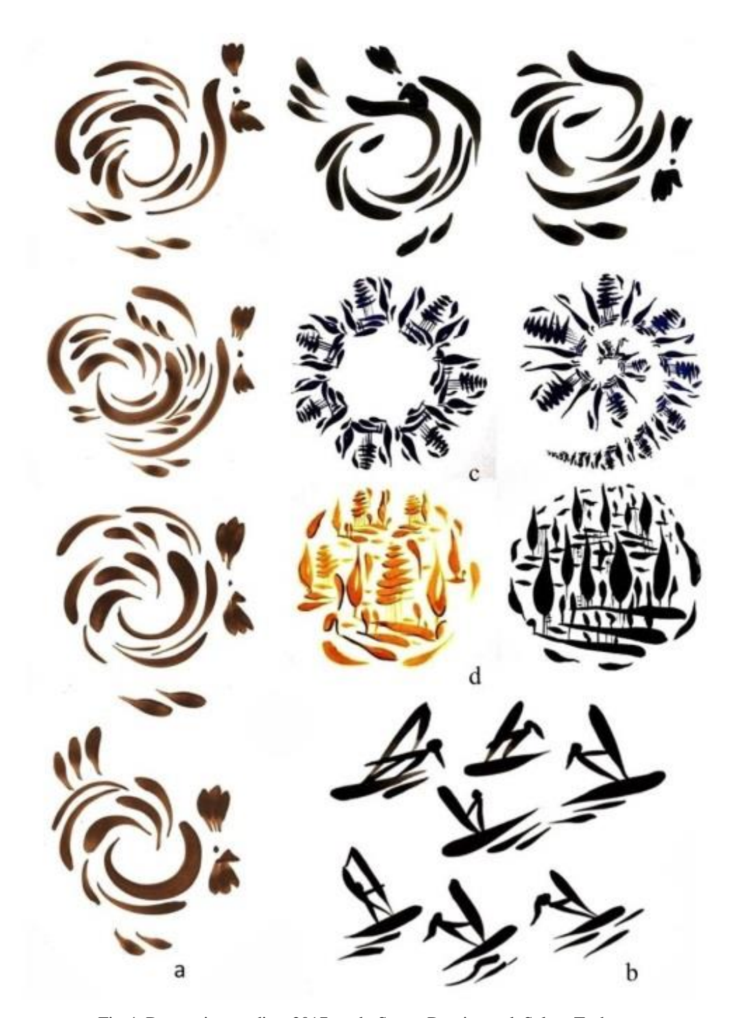
Fig.4. Decoration studies. 2017. a., b. Sonay Demir. c., d. Selma Turhan.