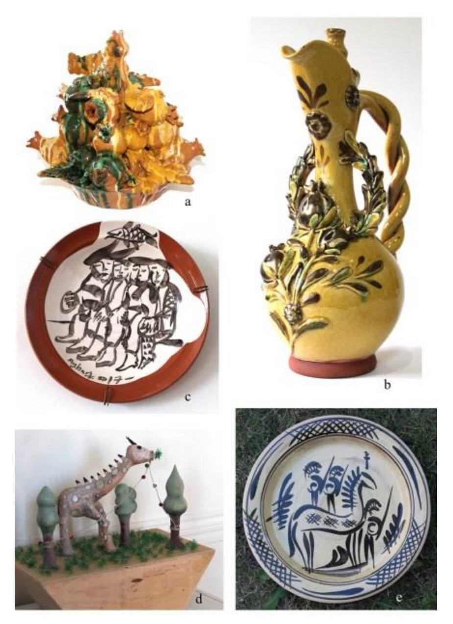
Fig.6. Artistic and traditional approaches in the workshop applications.

The figure of the giraffe (in Fig.6.d) of Burcu Gürcü is a true dimension and space interpretation of the description of a giraffe in the plate shown in Fig.1.k. Gürcü, whose works have the characteristics of sympathetic amicability and humor with the cartoon themes and expressions, contributes to traditional Çanakkale Ceramics by transforming the giraffe figure into a unique form – she created cups in the form of giraffes – by using traditional forming methods.