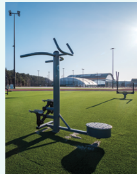
Sport facilities at AMU Morasko Campus built in 2020