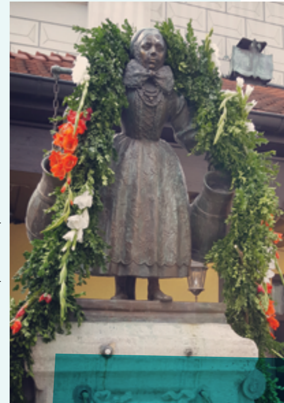
"Bamberka" at Old Market Square

out the first half of the 18th century. It is estimated that between 1719 and 1753 some 900 people had arrived. They were very quickly fused with the Polish inhabitants of the city. Today Bamberg People (Bambrzy) are regarded as a group of Poles of German origin. It could be that up to 5% of contemporary Poznań population can trace their ancestry back to the families who arrived from Bamberg in the 18th century. Arrival Day celebrations take place usually on the first Saturday of August. The Bamberg outfit (lavishly decorated especially for ladies) is regarded as one of the symbols of Poznań. When visiting the Old Market Square you can't miss a small fountain with the statue of a lady wearing a typical Bamberg dress and carrying two buckets over her shoulders. It stands in front of the former Customs House (Waga Miejska) and we call her "Bamberka" (a lady from Bamberg).