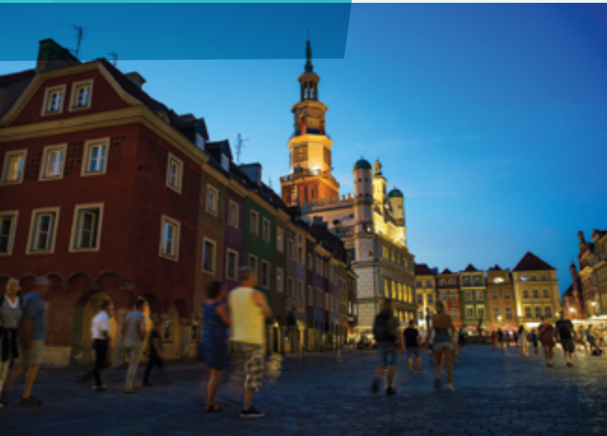
Old Market Square