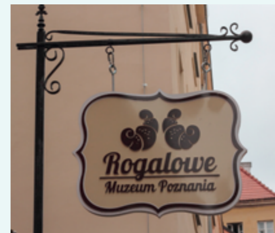
Rogalowe Muzeum

Muzeum Pyry is a museum devoted to a crop most commonly produced in the Wielkopolska region, namely potatoes. Muzeum Bambrów on the other hand provides you with intriguing insight into the lives and traditions of the immigrants from