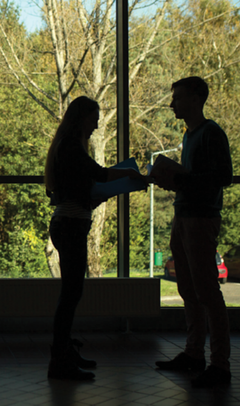
Morasko Campus is close to nature

pay for a medical consultation. The cost is then reimbursed by the health insurance company. Apart from the academic and public medical care systems there is also a well-developed private medical system.