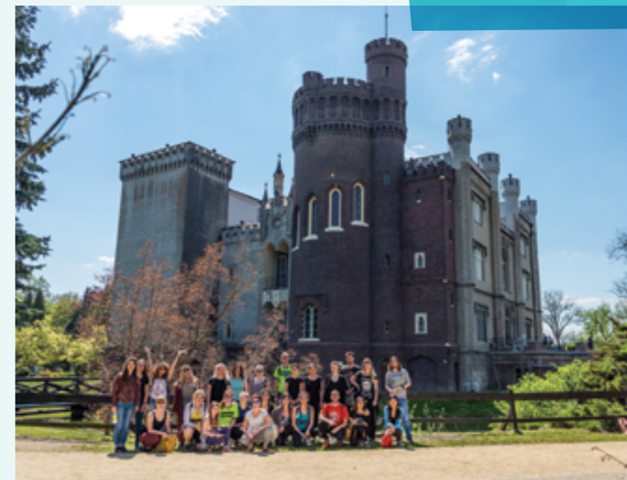
AMU student trip to Kórnik Castle

Apart from numerous cities which present architectural and historical values, there are many countryside areas presenting their own unique cultural heritage. Wooden churches, small mansions or country manors and palaces will show you the history behind famous individuals and their families. Theme parks, historical trails, archaeological sites and castles, together with intriguing cities and villages give you perspective on the presence of human settlements in this part of the world.