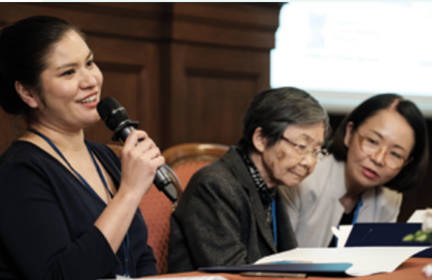
Conference in occasion of 100 anniversary of Polish-Japanese diplomatic relations in December 2019