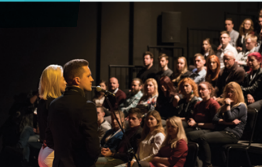
START Students Theatre Festival in 2018

The objective of the Programme is to promote Polish language in the world by enabling foreigners interested in Polish language and Polish culture to study or carry out research projects in Poland. The Programme is addressed to students of