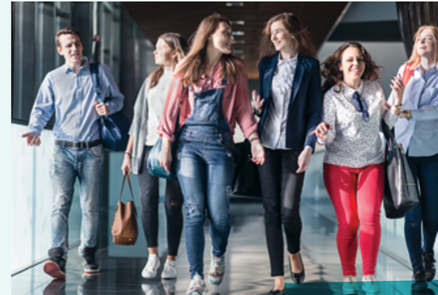
AMU students