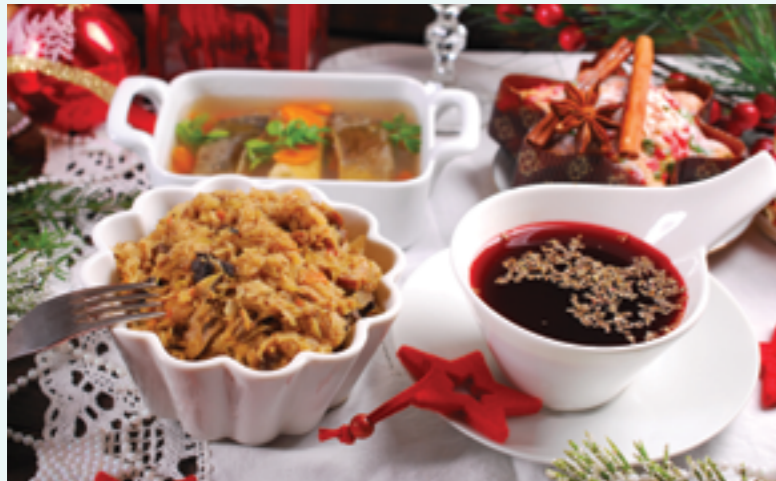
Polish Christmas dishes

of the holiday is the Christmas Eve supper, taking place in the evening of 24th of December ( Wigilia ), right after the first star appears in the night sky. Special menu which should include 12 courses is served to participants of the dinner (with an interesting rule – no meat!). You will be served red beetroot soup (borscht or “ barszcz ”)