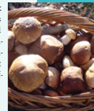
Forest mushrooms