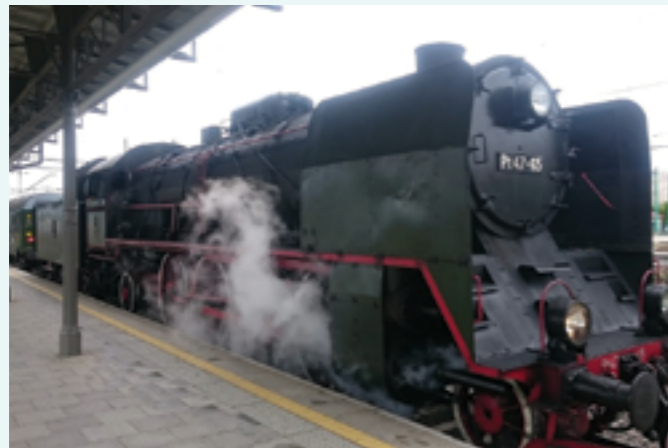
Steam train on Poznań Main Railway Station

and Poznań. Each year a special Steam Locomotive Parade is organized during the first weekend of May.