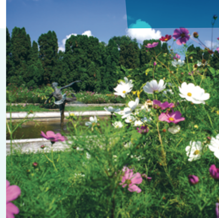
AMU Botanical garden in district of Ogrody

It is located about a few steps away from the Ogrody tram terminus (ul. Dąbrowskiego 165) which gives convenient access to the city centre. It covers an area of 22 hectares and is open to the public for free. Plant collection counts around 7 thousand species. It is a perfect place to rest or study in the presence of beautiful nature.