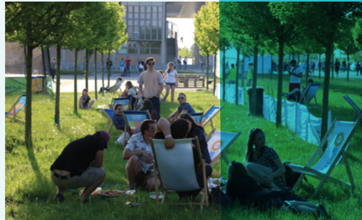
Grand Barbecue Party during Students Days in 2018

*Please, double check the current academic calendar as the COVID restrictions may have altered them.