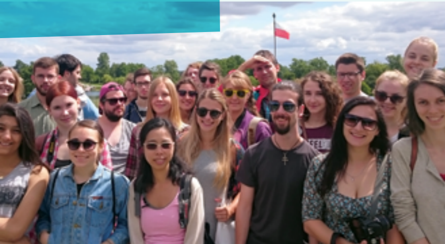
A sightseeing tour to Ostrów Lednicki Island during Summer School of Polish Language and Culture in 2016

three weeks to complete and is organized in August, also online. It provides a cultural programme which familiarizes you with history, heritage and tourist attractions of the city and region. That includes lectures in English and Polish by University professors as well as guided local tours. There is also time for little get togethers and networking at parties