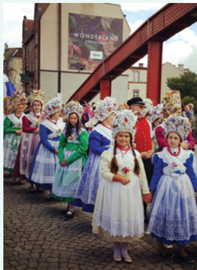
Bamberg community in Poznań - traditional costumes

Norway, US and Canada, just to name a few). There are about 2 million foreigners living and working in Poland, a majority coming from Ukraine. Main cities according to the number of inhabitants are Warsaw 1,8 million, Kraków 780 thousand, Łódź 670 thousand, Wrocław 640 thousand and Poznań 535 thousand.