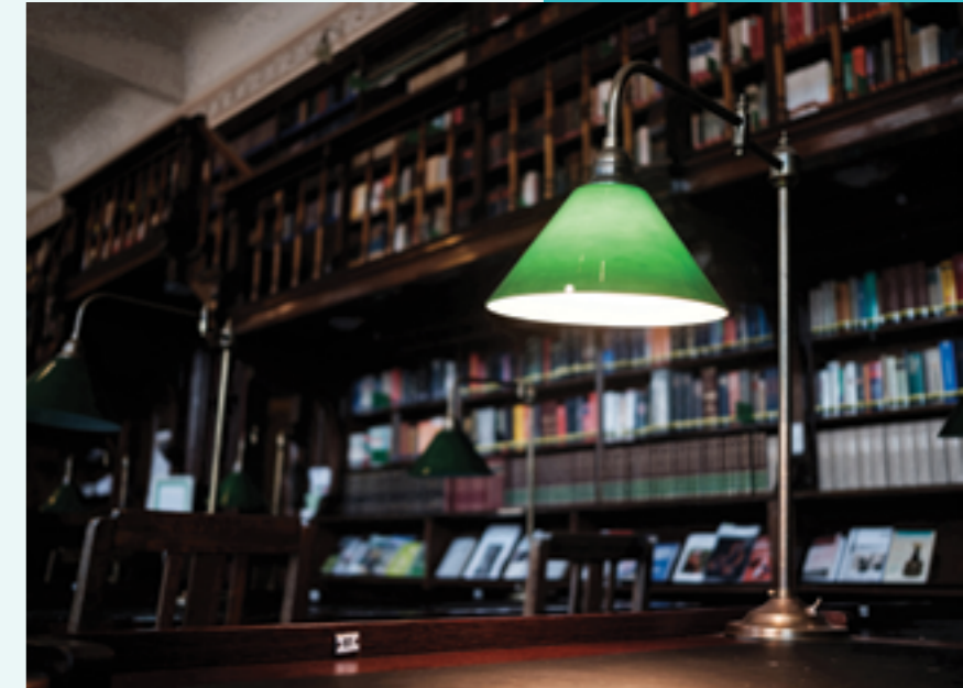
Historical reading room of AMU Library