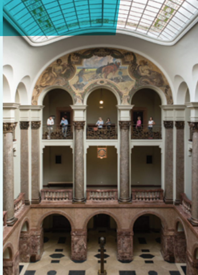
Faculty of Polish and Classical Philology