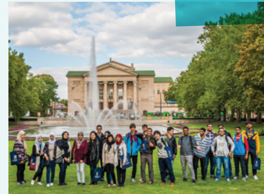
Students during sightseeing tour of Poznań

It aims to encourage young talented people from the countries listed on the Program to pursue studies at the best Polish HEIs.