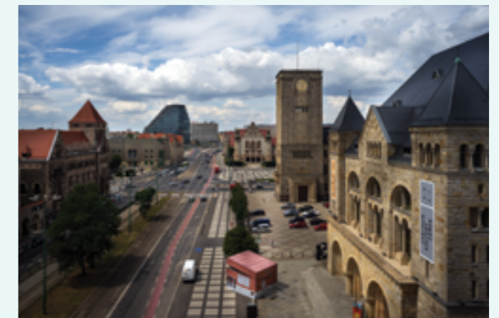
Imperial Castle

It is a part of Poznań where the headquarters of our University are. Originally designed at the beginning of 20th century as a new central district which would connect old downtown with three new quarters