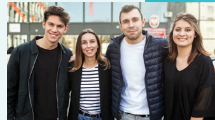
AMU students

Socializing with Polish students and establishing friendships could open the world of national and in a way very private traditions up for you. You will know what we mean if you go to a Polish wedding ( wesele ) or a Christmas Eve supper called Wigilia . In both cases be sure that you will get a lot of food and unforgettable memories.