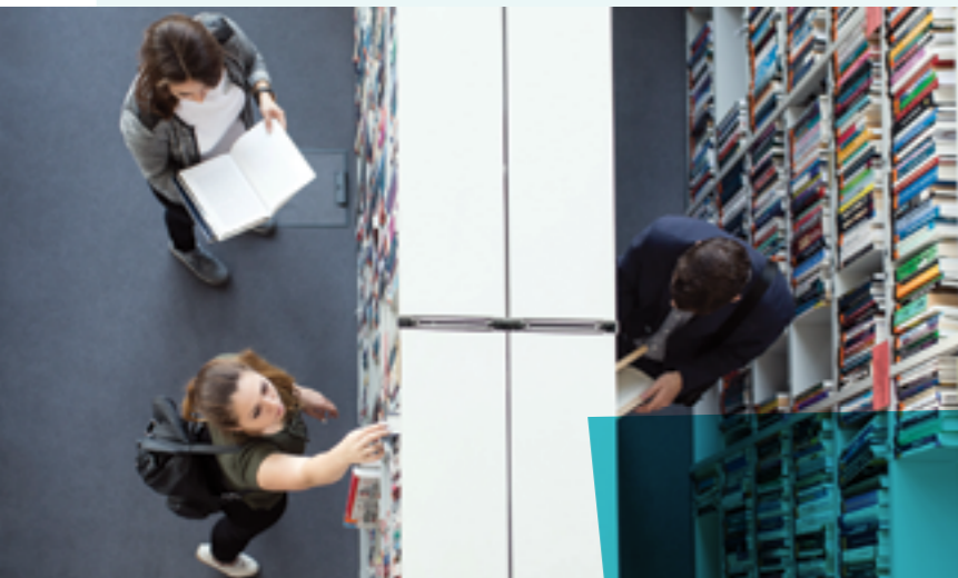
Collegium Polonicum Library