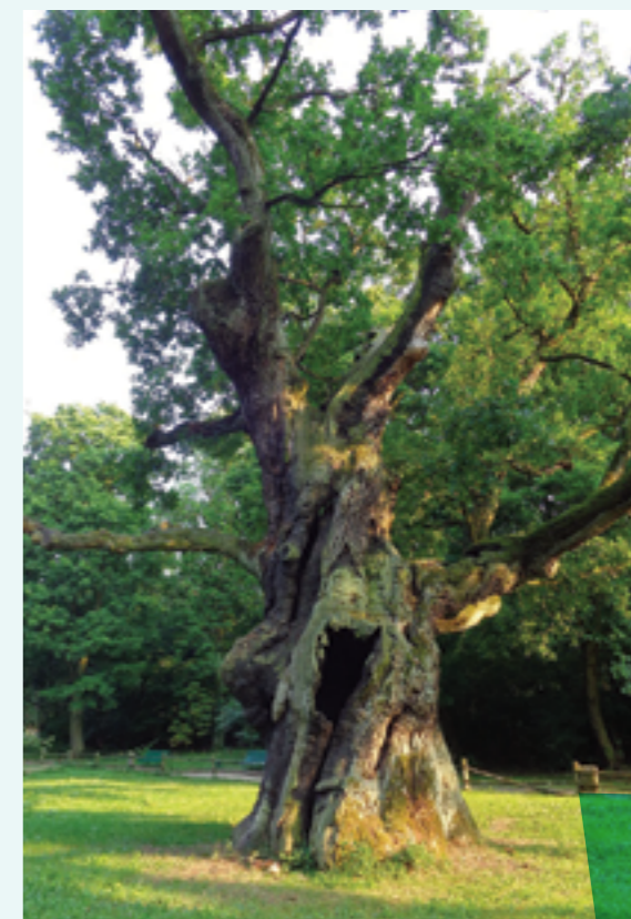
Famous old oaks of Rogalin

There are some inter-regional bus companies owned by private or state carriers. The schedule and price is however often less attractive than travelling by train. State or local-government carrier names usually include the letters "PKS" (for example PKS Poznań). Go to www.en.e-podroznik.pl to find the best connections.