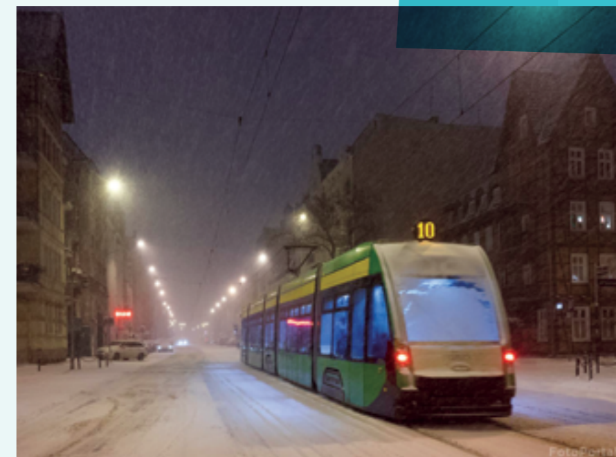
A snowy street photo: fotoportal POZ

It is hard to describe the current climate in Poland while we observe completely unusual weather patterns. Snowy winters are rare, most winters tend to be mild with only a few snow days and temperatures below. Some regions, including Wielkopolska, became accustomed to long autumns without frost, ice or snow with much warmer temperatures than it used to be 20 or 30 years ago. Summer climate give a