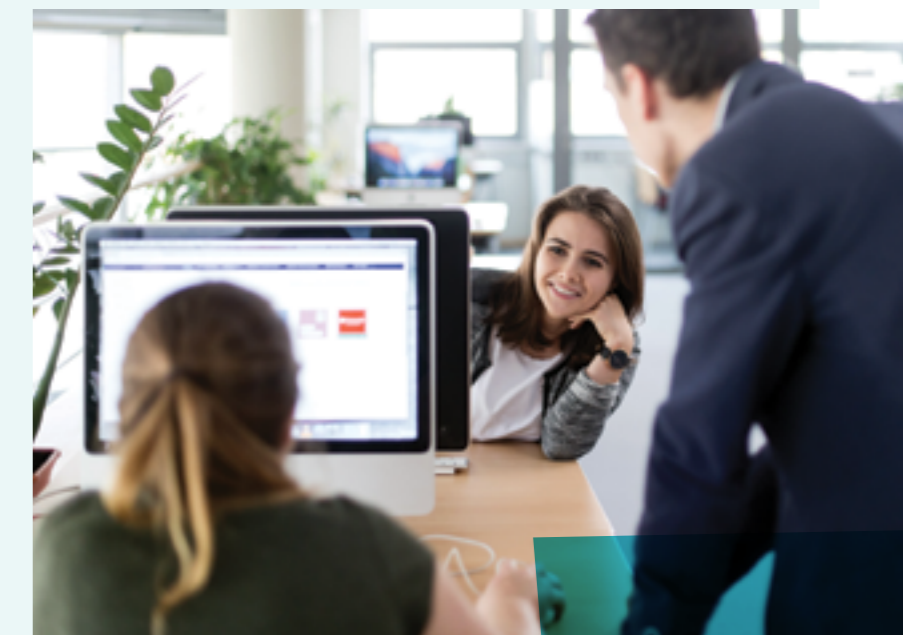
Just fill in an application!