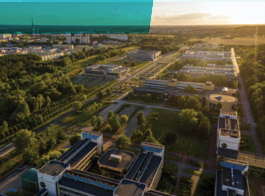
Aerial view of modern Morasko Campus

while three others Babilon Y , Jagienka and Zbyszko Z are only one stop (long distanced one but about 4 minutes ride) of fast tram route (Słowiańska stop).