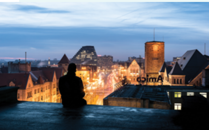
Central Campus at sunset

It's good to know that you can travel around Poland and Europe using bus services of private carriers, like: Flixbus, Eurobus, Sindbad (just to name the largest ones), and many others. Check their websites for details: Flixbus https://global.flixbus.com/ , PKS POLONUS www.pkspolonus.pl , Majer