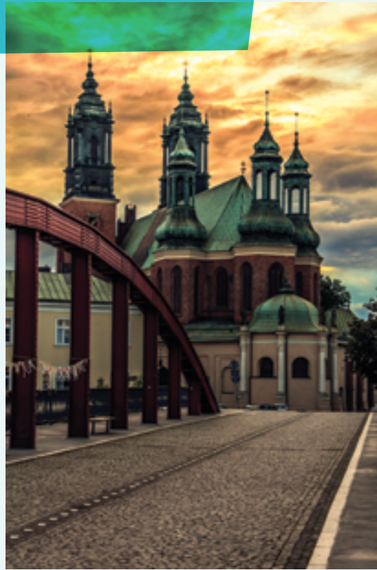
Poznań cathedral church

Scottish owners! Come here at midday to see the famous goats show ( koziolki ) and hear the bugle call from City Hall's tower.