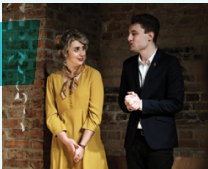
Poetry meeting on Faculty of Polish and Classical Philology in April 2019

The Polish Dance Theatre (Polski Teatr Tańca) is a very good option for non-Polish speakers: