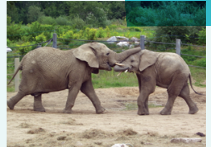
Elephants in New Zoo

Poznań's New ZOO is a paradise for animals and animal lovers. Spacious enclosures for almost 400 species covering the area of 121 hectares make this ZOO a unique place. In recent years it became a comfortable refuge for animals which were illegally kidnaped from their original environment or kept in awful conditions. Expect to see a modern elephant-house (one of the biggest in Europe), a tiger-en-