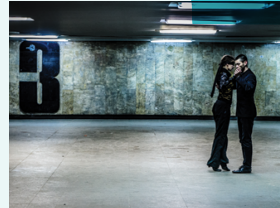
Dancing underneath Rondo Kaponiera (underground passage)

hacker-free country. The best option is to purchase internet connection service on mobile phones. There are cheap pre-paid cards which provide really good offers. To use Polish SIM cards you need to be sure that your phone has no SIM lock.