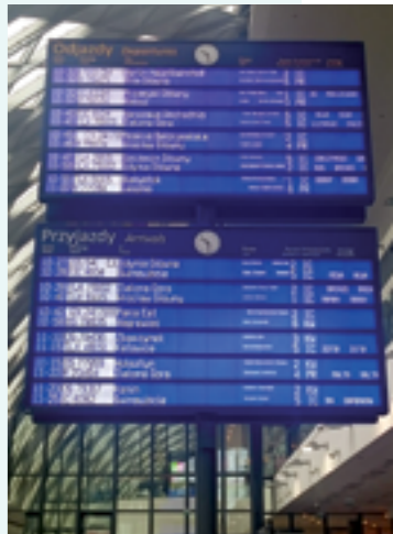
Inside of a New Station building

4) New terminal (Nowy Dworzec) together with the Avenida shopping mall occupies several floors above platforms 1, 2 and 3. The main Bus Terminal for regional and international busses occupies the ground level and is accessible either from the east (Aleja Króla Przemysława), from the north (ul. Składowa) or from the inside of the shopping mall if you're entering from an overpass directly into the mid-section of that long glassy pavillion and are prepared to walk past the McDonald's to the nearest escalator and go one floor down to street level.