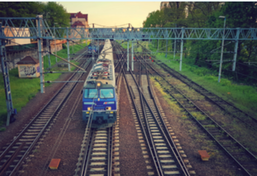
Train is a convenient way to move around Poland fotoportal POZ

area of 113 sq. km). About 150 kayaking routes on rivers and 10 thousand paddle friendly lakes makes from Poland a real paradise for kayakers. In the south you can enjoy several mountain ranges - all of them with the presence of marked trails, mountain shelters and resorts, perfect for hiking. They include Sudety mountains in the southwest (with Mt. Śnieżka 1602 m in Karkonosze Range) and much younger and higher Karpaty in the southeast (with Tatry Mountains and Mt. Rysy as the highest point of Poland, 2499 m). Also two less known, but equally beautiful ranges of Pieniny with Dunajec River Gorge and Bieszczady in the southeast edge of the country, bordering Slovakia and Ukraine