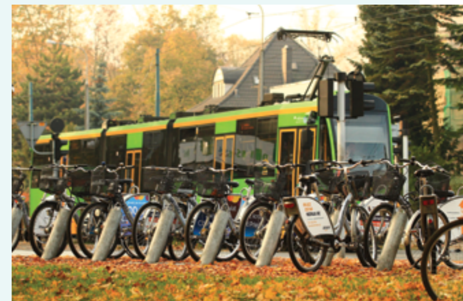
City bikes in Poznań

Non EU students/visitors should purchase health insurance in their home country, before departure. In the case of the ISIC or Euro <26 card, insurance is included in the card and it is not necessary to buy another one unless you want to increase its